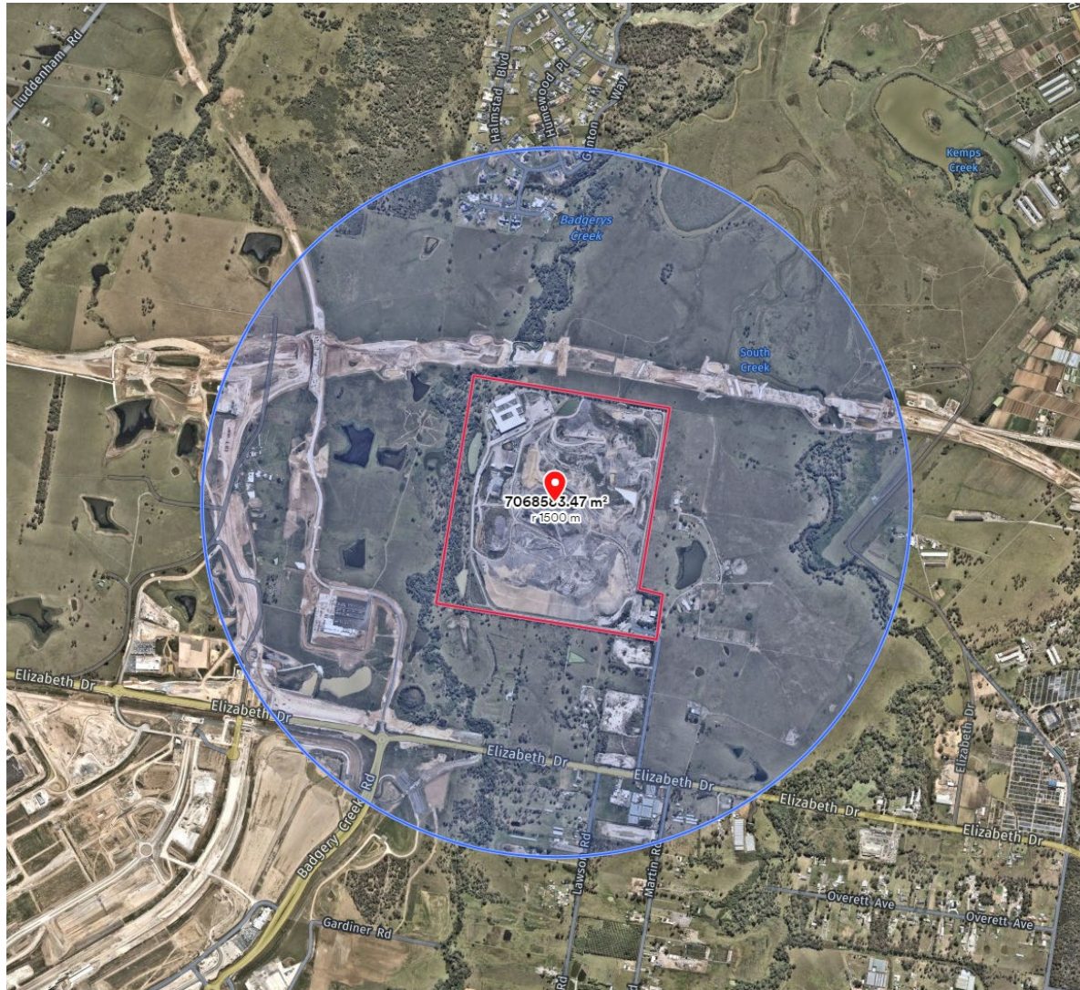
Map 1 - General location of site (500 metre radius)