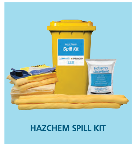
HAZCHEM SPILL KIT