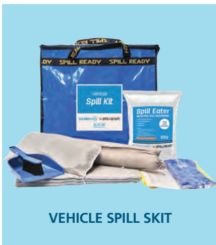
VEHICLE SPILL SKIT

Cleanaway has a comprehensive range of spill kits. We can also custom design a spill kit to suit your needs. Spill kits are available as Vehicle Kits, General Purpose and Hazchem.