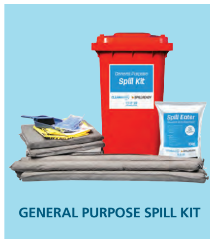
GENERAL PURPOSE SPILL KIT